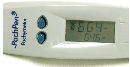
Figure 3.5 - Measurement Screen