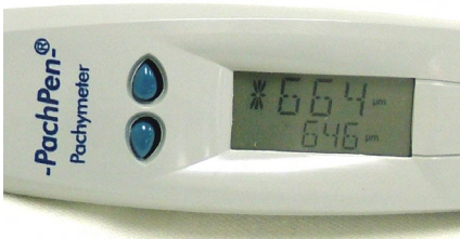
Figure 3.7 - True IOP Screen