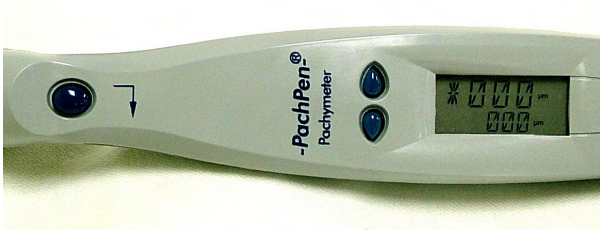
Figure 3.3 - Action Control Buttons and LCD