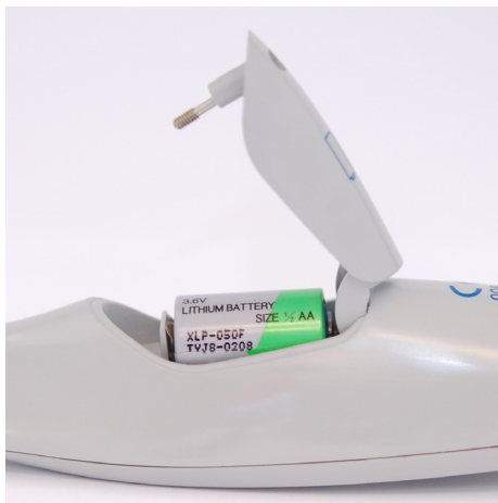
Figure 3.2 - Battery Insertion