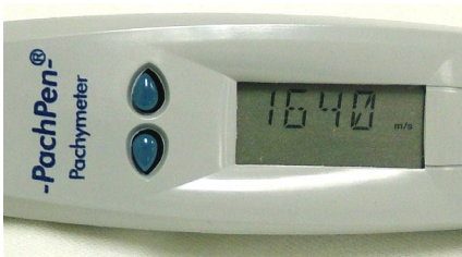
Figure 3.4 - Speed of Sound Screen