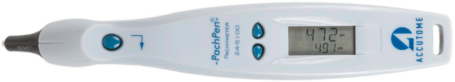
Figure 1.1 - PachPen Pachymeter

The Accutome PachPen pictured below has all the features that make it easy to obtain extreme accuracy and improved patient outcomes.