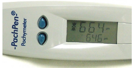
Figure 3.6 - Measurement Screen Starting New Patient

WARNING! THE PROBE TIP MUST BE PROPERLY DISINFECTED BEFORE TAKING ANY MEASUREMENTS ON A NEW PATIENT.