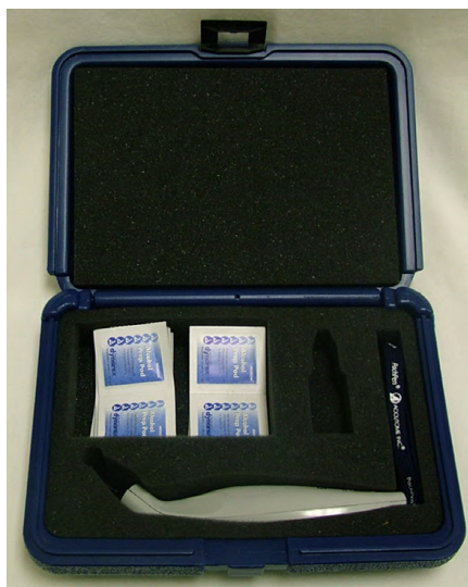
Figure 3.1 - PachPen Unpacked