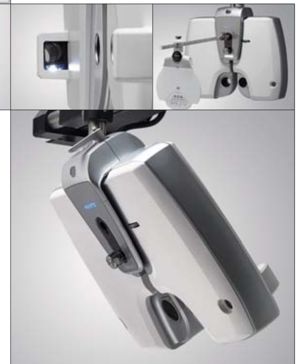
Tiltable Refractor Body

Customized exam is available for those who have different monocular heights within adjustment +/- 3mm.